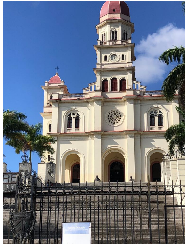
The Marian Shrine in El Cobre: Our Lady of Charity

The first novitiate was in the upper level of the church.